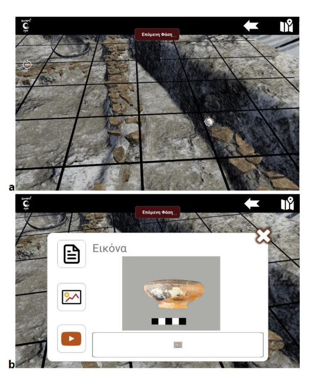
Figure 4. a. The location of each info-point is visible through AR markers, which are part of the Smart Eye system's AR interface, b. After the selection of the info-point, the popup window with textual or multi media information appears.

In this paper the software/application evaluation methodologies according to international literature, the evaluation process of the Smart Eye system, and the problems identified and the way they were solved during the 1st evaluation of the application will be presented, as well as the problems identified during the 2nd evaluation.