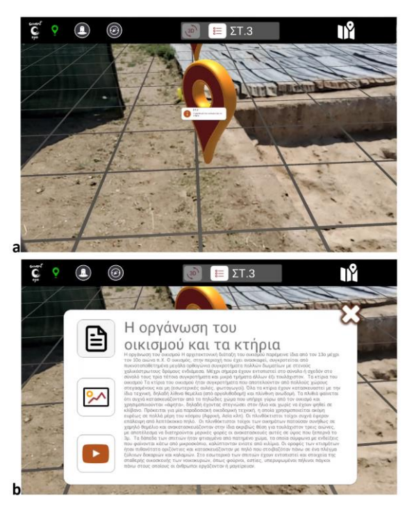
Figure 2. a. The location of each info-point is visible through AR markers, which are part of the Smart Eye system's AR interface, b. After the selection of the info-point, the popup window with textual or multi media information appears.

sites (Thermi and Toumpa) of Smart Eye are located, b. The Smart Eye system's Web GIS user interface (archaeological site of Toumpa). Blue dot indicates the user's location and red pins indicate the points of interest (AR markers).